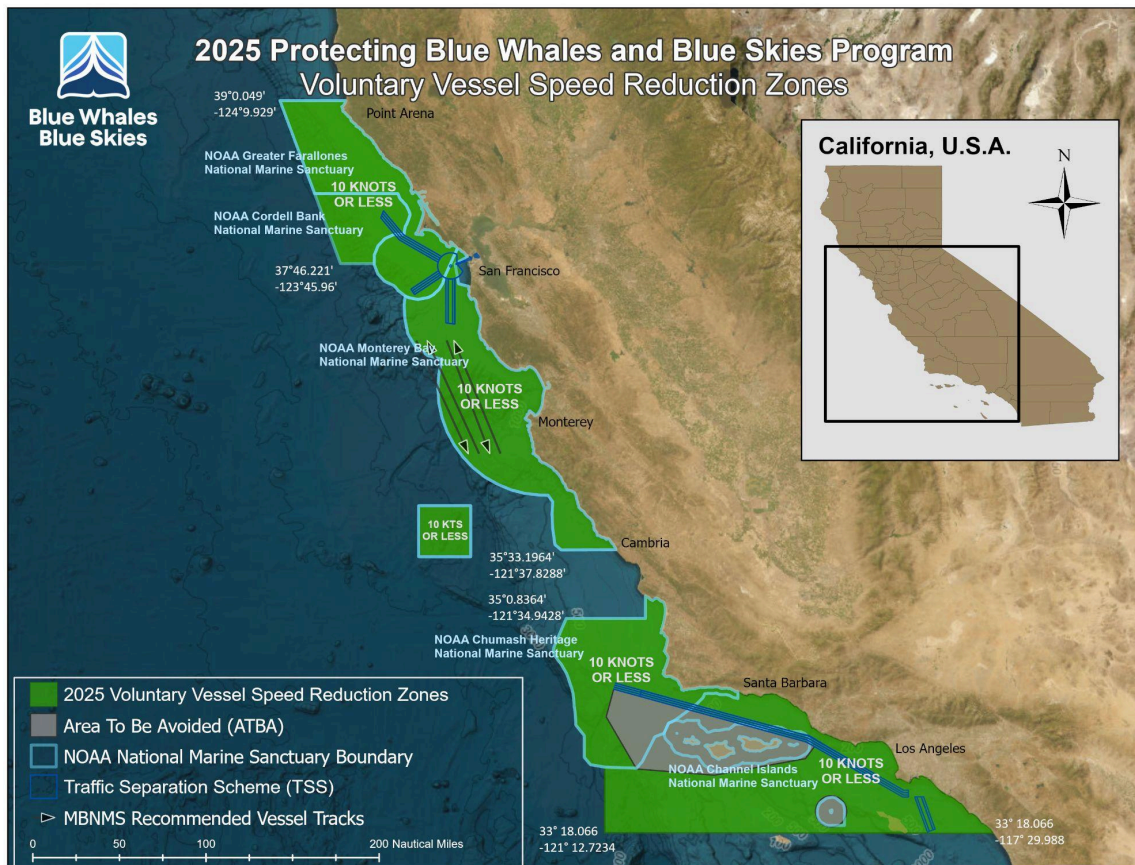
Figure 1. 2025 Protecting Blue Whales and Blue Skies Program Zone Map

Sincerely, The Protecting Blue Whales and Blue Skies Program Coalition